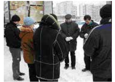
(This message is going around the world. Moscow above.)

The powers of earth, uniting to war against the commandments of God, will decree that all, 'both small and great, rich and poor,