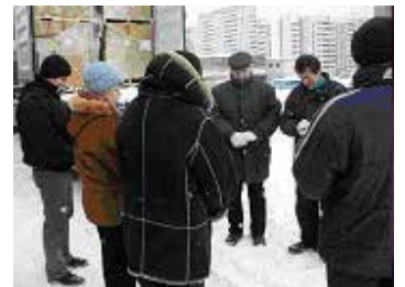
(This message is going around the world. Moscow above.)

"The Protestants of the world, the Adventists excepted, with the same Bible as their cherished and sole infallible teacher, by their practice, since their appearance in the sixteenth century, with the time-honored